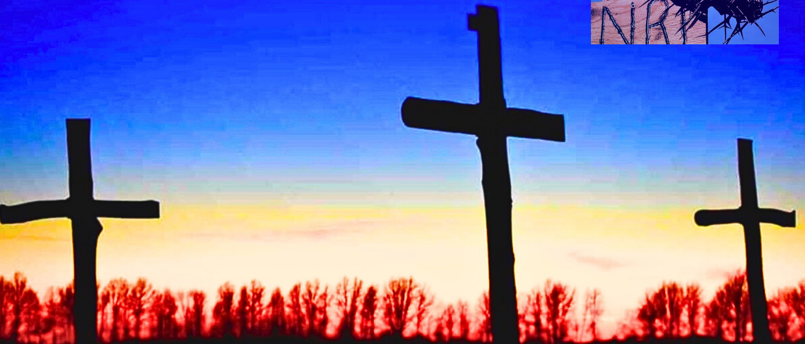
Dust in Time Photo Credit

He IS Risen Sunrise Service Mar.31st @7am